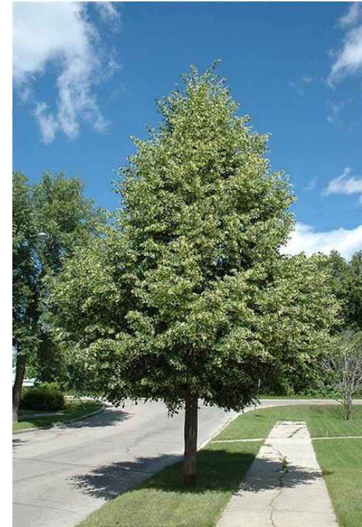
Lime - Tilia cordata Greenspire