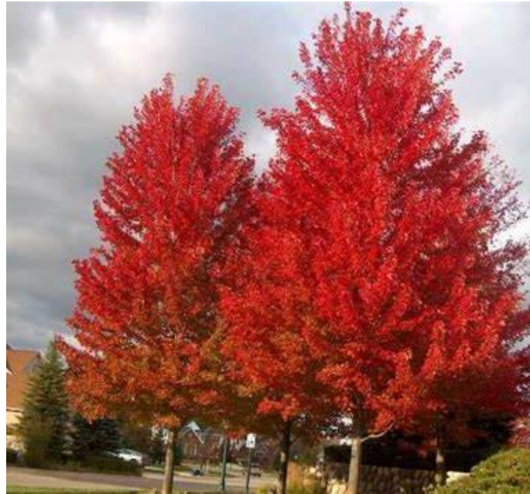
Maple Acer x Freemanii Celebration