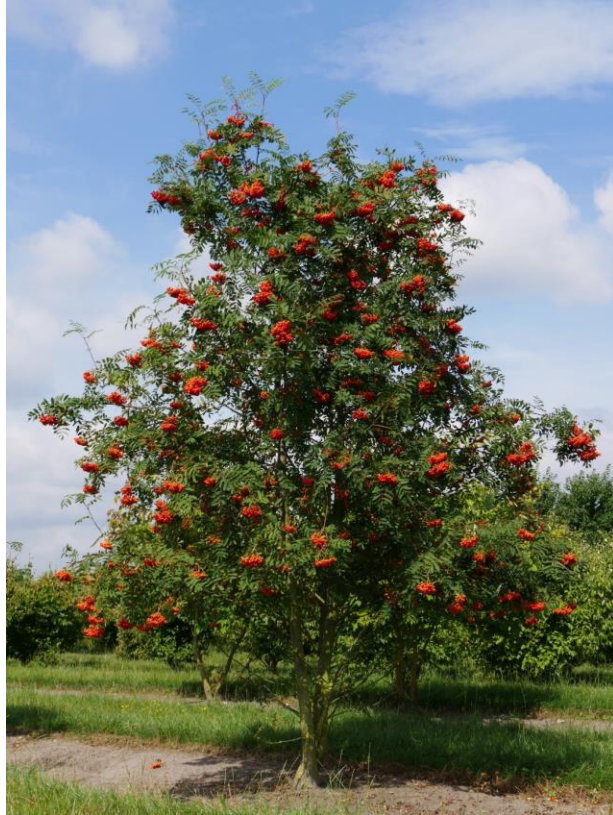
Rowan Sorbus Aucuparia