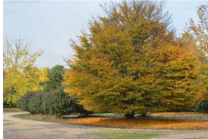
Fern Leaf Beech Fagus sylvatica 'Aspleniifolia'