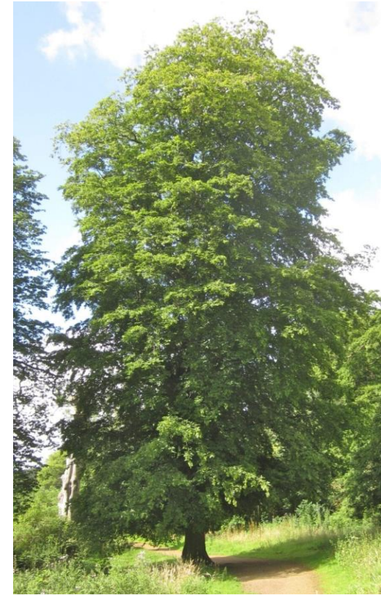
Hornbeam Carpinus betulus 'Frans Fontaine'