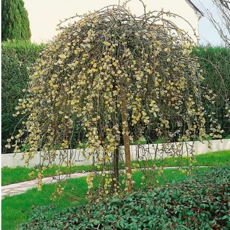
Kilmarnock Willow Salix caprea 'Pendula'